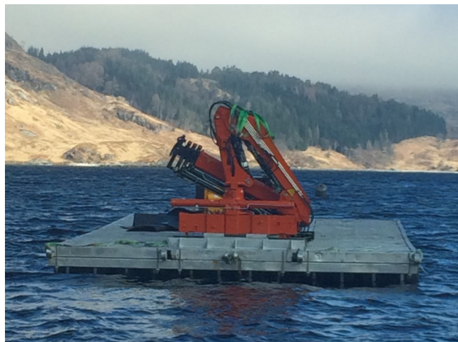
Typical pontoon structure with knuckle boom crane

Thistle Marine have witnessed a number of fish farm operators using regular floating walkway sections bolted together to form large pontoon sections for loading and transporting feed bags out to fish farm pens. Following a review of their suitability we have designed a bespoke, modular product which allows the handling crane to be securely mounted to the pontoon structure. Further standard sections are then utilised to create the load area. As the structure is modular, different shapes, sizes and load capacities of pontoons can be created.