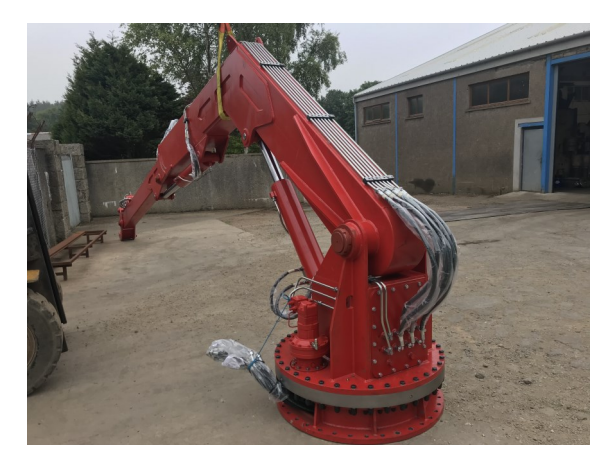
\hbox{@} Thistle Group Limited 2017, information correct at time of publish

AB42 1TF Tel: +44 (0)1779 477 210 sales@thistlemarine.co.uk www.thistlegroup.co.uk